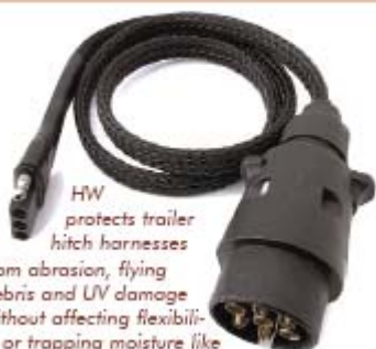
HW protects trailer hitch harnesses from abrasion, flying debris and UV damage without affecting flexibility or trapping moisture like convoluted tubing.

HW is the perfect solution for use on chains and cables to protect painted or laminated surfaces from scuffing and wear.